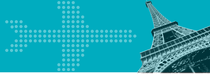
Average Number of trips per year